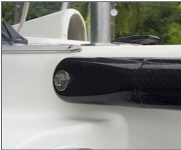
Through Hull - Bolts