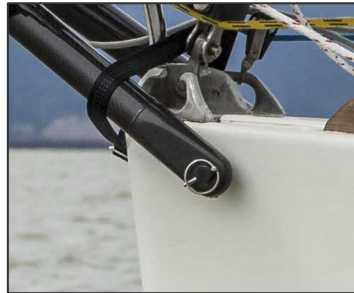
Through Hull - Quick Release